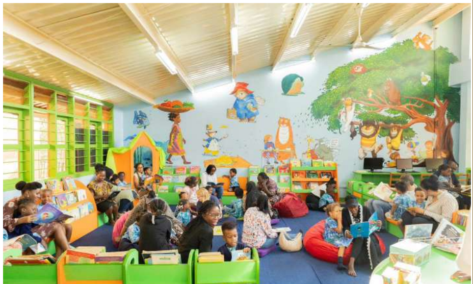
Children and parents enjoying old and new books, and one of the beautiful new murals in the library