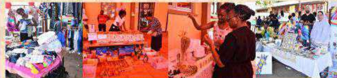
We did all our Christmas shopping at the exciting range of different stalls