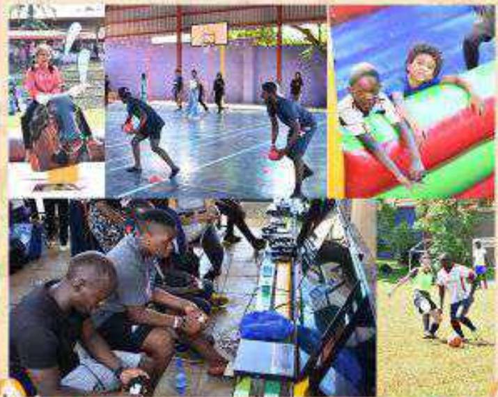
Plenty of activities to keep all ages busy

After a rainy start to the day, we were very pleased when the sun came out! And with the sun came hundreds of children, parents and friends of the Rainbow community. With live music from the various school bands, friendly competitions in football and dodgeball, and even visits from the jolly fellow himself (Santa Claus), the Rainbow Christmas Market really was a fun-filled day for the whole family. Our younger children thoroughly enjoyed making use of the bouncy castle, and many of our older students and parents enjoyed the video game station.