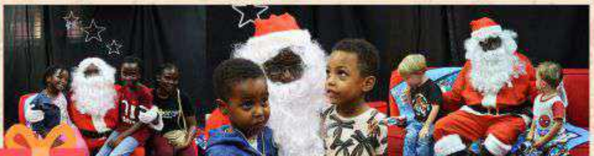
Santa Claus came to visit the Rainbow children!