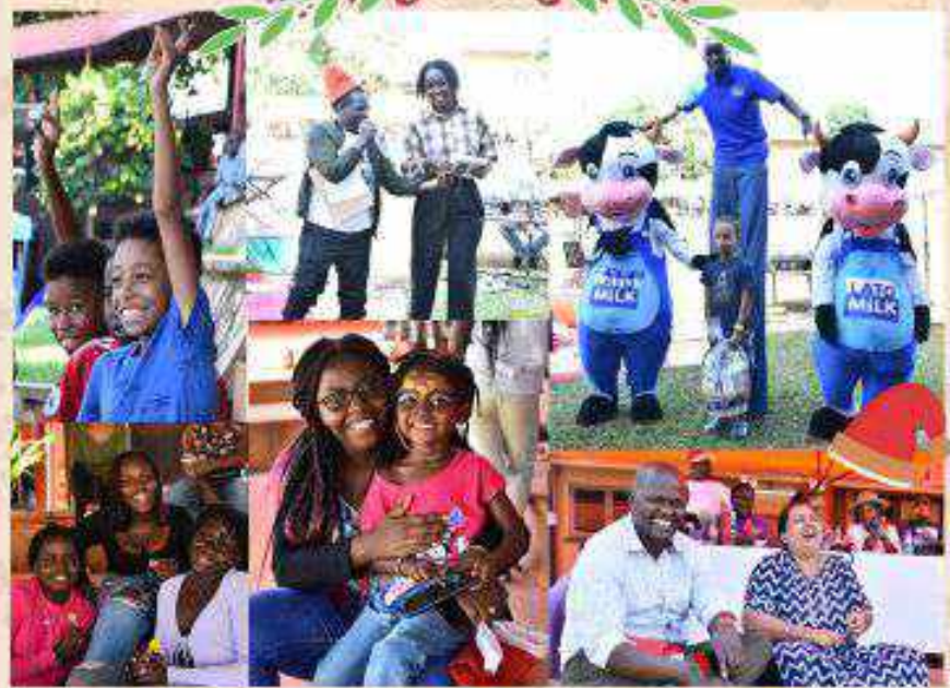
The day ended with 68 lucky raffle winners and smiles all round!

All in all, a true Community event in true Rainbow style.