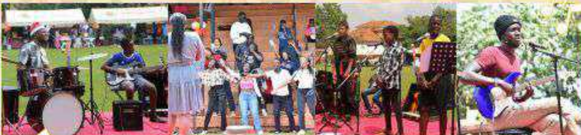
Live music entertainment brought the spirit of Christmas to the day

Saturday 26th November saw the Rainbow Christmas Market take place again for the first time since 2019. It was a roaring success and we raised a whopping 6,400,000UGX! Of the money raised, 2,754,500UGX goes towards the Rainbow Student Council initiatives and the rest will be donated to local charity initiatives, including buying wheelchairs to be given to local clinics. A huge thank you to everyone who joined us at the event, everyone who donated a raffle prize or items to be sold at the Student Council stall and everyone who helped out on the day.