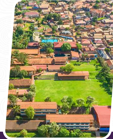
Ample playing field space