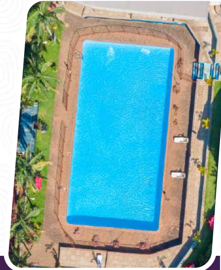
A full-size swimming pool

We have an extensive campus with excellent facilities including: